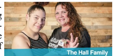
The Hall Family

Here in Stark County the local Habitat chapter has built more than 500 homes. 2019 will see them build or preserve 30+ homes. This has an overwhelming effect on a family. Owning a home means a foundation of safety and the ability to start to build wealth. Getting people off the street is great. This is a huge step beyond. Habitat helps families lift themselves out of the vicious cycle of poverty.