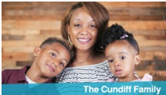
The Cundiff Family

My fellow Zioners! I am excited to talk about Faithbuild 2020 and Habitat for Humanity. Habitat for Humanity was founded in 1978. Since then they have built, rehabilitated or preserved more than 800,000 homes! That makes Habitat the largest Not-for-profit builder in the world! They have touched the lives of more than four million people. And here is the cool thing, they are not giving these homes away. This is not a charity. They help people who are